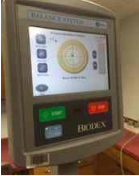
Illustration 5: Biodex System Viewing