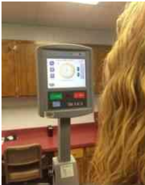
Illustration 3: Biodex Balance System Viewing Screen