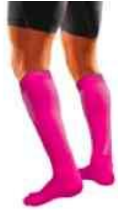
Illustration 8: ShockDoctor®