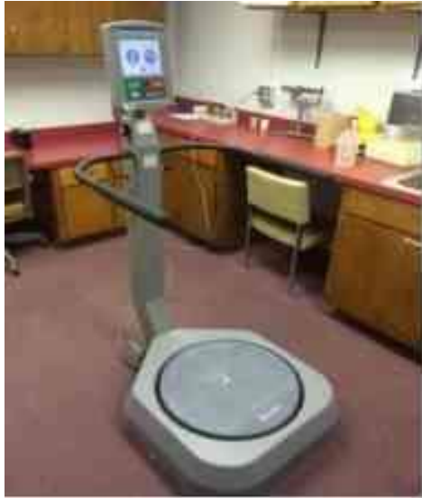
Illustration 1: Biodex Balance System SD Unilateral