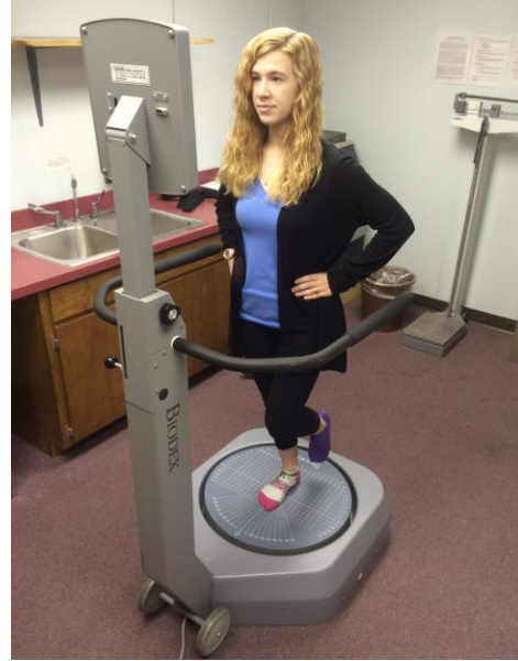
Illustration 6: Dominant Leg