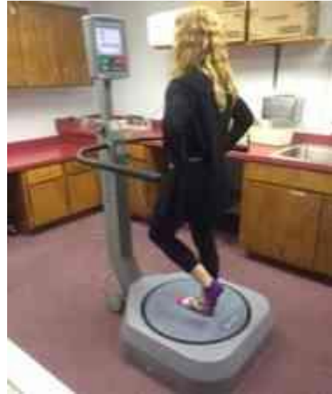
Illustration 2: Dominant Leg Stance on the Biodex System